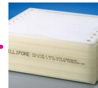
Pellicon 2 Maxi Cassette