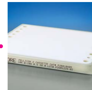
Pellicon 2 Cassette

Utilizing Pellicon® cassettes ensures optimum performance and scalability