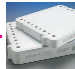
Pellicon 3 Cassettes