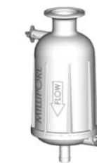
Sanitary flange 38 mm (1 1/2 in.) inlet and hose barb 14 mm (9/16 in.) outlet*