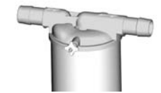
Hose barb 25 mm (1 in.) inlet/outlet