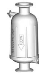
Sanitary flange 38 mm (1 1/2 in.) inlet/outlet