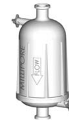
Sanitary flange 19 mm (3/4 in.) inlet/outlet