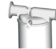
Sanitary flange 38 mm (1 1/2 in.) inlet/outlet