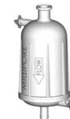
Sanitary flange 19 mm (3/4 in.) inlet and hose barb 14 mm (9/16 in.) outlet*