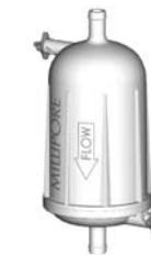
Hose barb 14 mm (9/16 in.) inlet/outlet