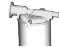
Sanitary flange 38 mm (1 1/2 in.) inlet and hose barb 16 mm (5/8 in.) outlet